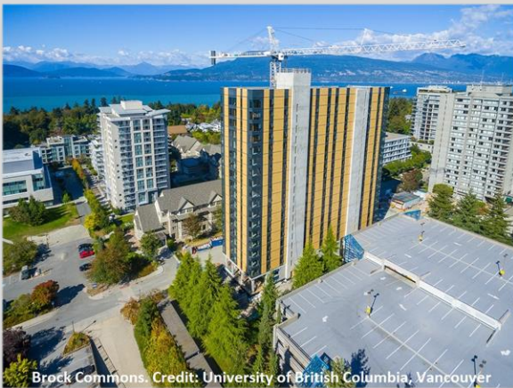
Brock Commons.

To see our properties for sale, visit our Natural Resources Group website